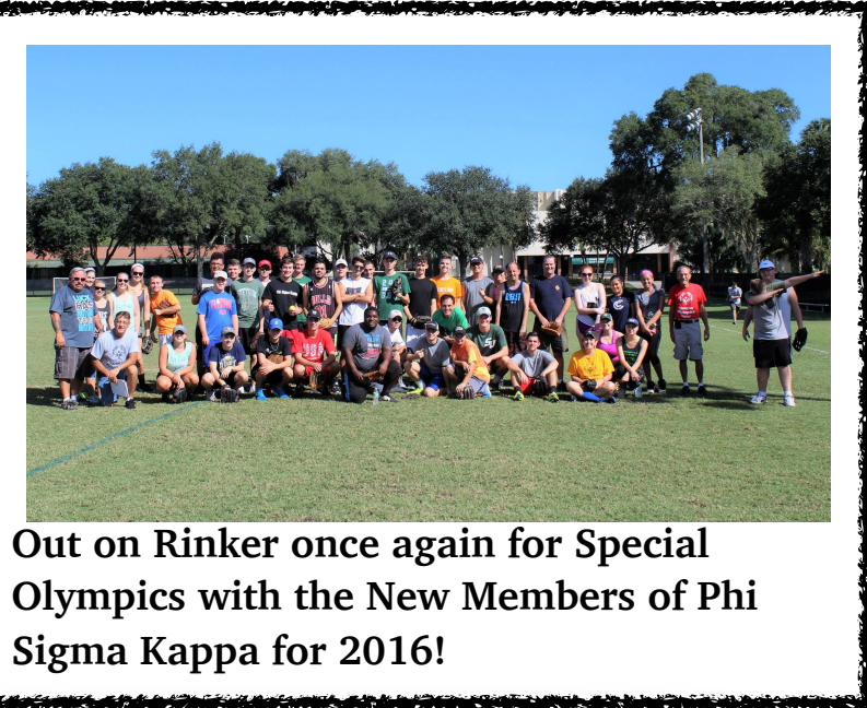
Out on Rinker once again for Special Olympics with the New Members of Phi Sigma Kappa for 2016!

Stepping out of the CUB to the applause of the new and old members of Stetson's wonderful sororities.